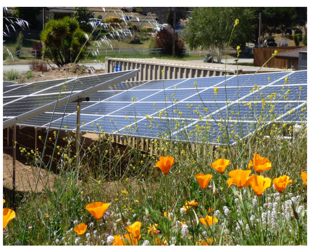
Aromas Water District is proud of the installation of a Solar Power System to generate clean power and pass the savings of $35,000 in energy costs per year on to our customers!